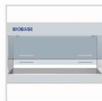
Double Sides Double sides work bench, operators can sit face to face.