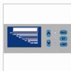
LED Display Microprocessor control system, LED display.