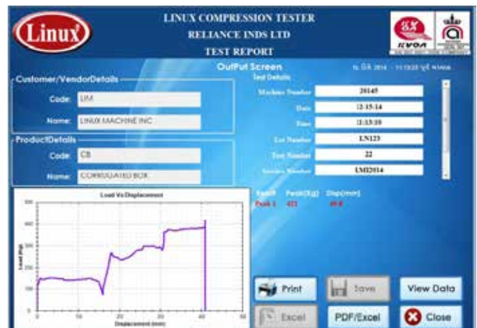
Sample Test Screen