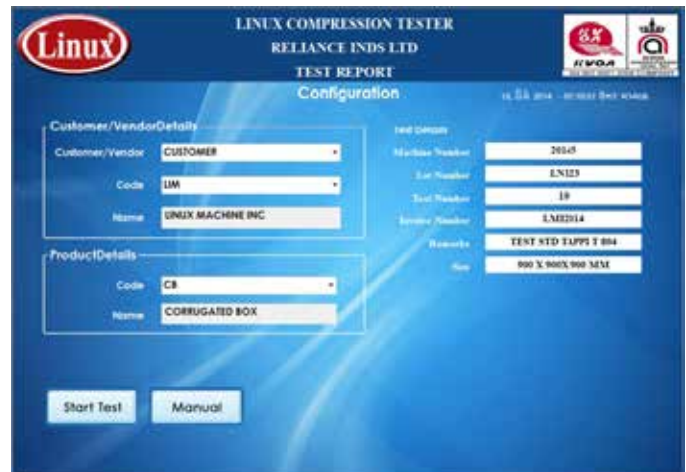
Sample Test Configuration Screen